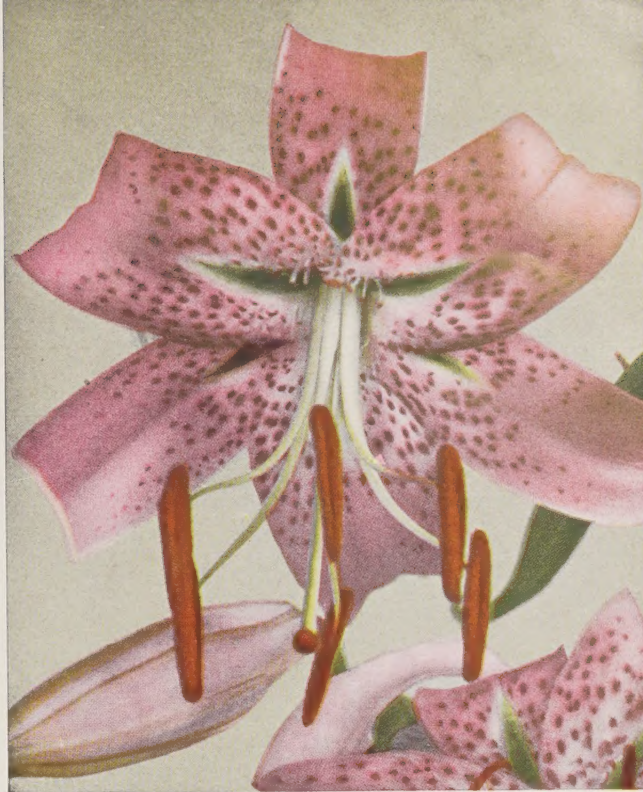
L. SPECIOSUM RUBRUM

Soil for planting should be well worked to a depth of 18 inches. Work in humus material and a small amount of commercial fertilizer. Avoid locations where diseased bulbs have been planted and as a precaution against rot dust bulbs before planting with a protectant such as Spergon. Plant as early as possible to keep bulbs fresh and plump.